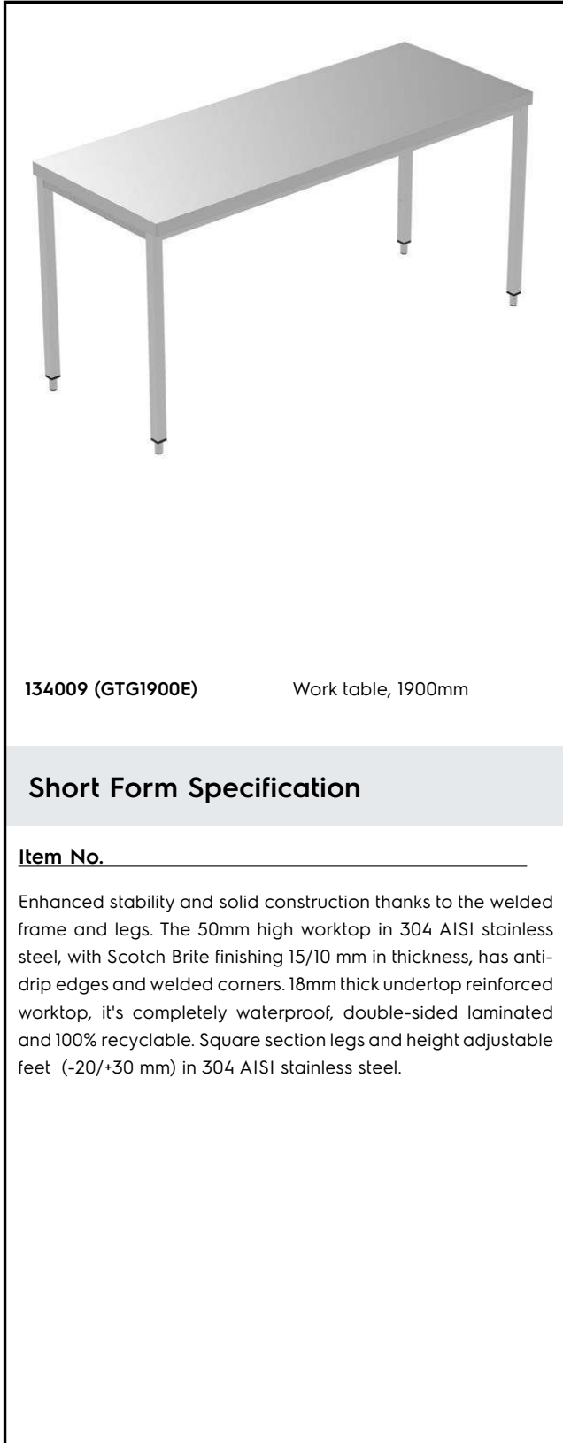
134009 (GTG1900E) Work table, 1900mm